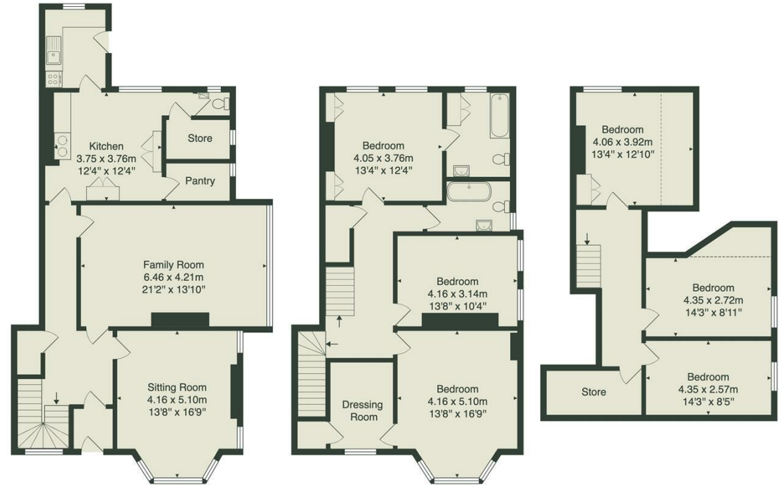
Ground Floor First Floor Second Floor

Total Area: 243.2 m 2 ... 2618 ft 2 All measurements are approximate and for display purposes only. No liability is accepted by either the agency or Box Property Solutions Ltd as to the exact measurements of the rooms. Box Property Solutions Ltd retains the copyright on this plan and allows agents to use it with agreed permission.